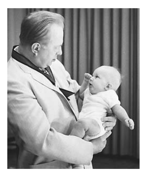
The A-R-C Triangle